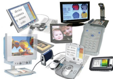
Some of the low vision aids that may improve the way you see the world!